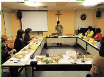
Flower Art Lesson

[Equipment ] Grand piano, Drum, Guitar, Amplifier, Projector, Audio, Microphone, PC, etc.